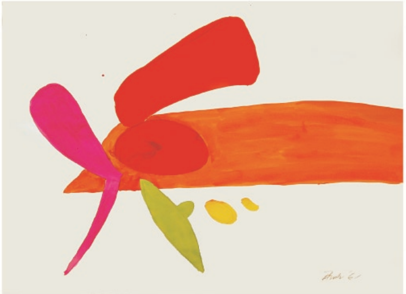
Jack Bush UNTITLED 1961, Gouache on Paper