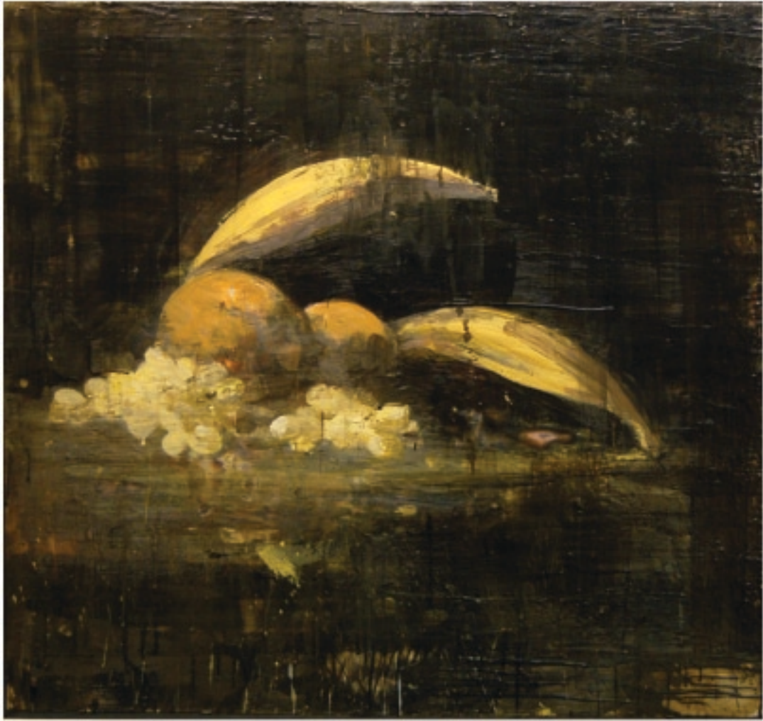
Tony Scherman STILL LIFE 1993, Encaustic on Canvas, 40 1/2 x 37 3/4 inches