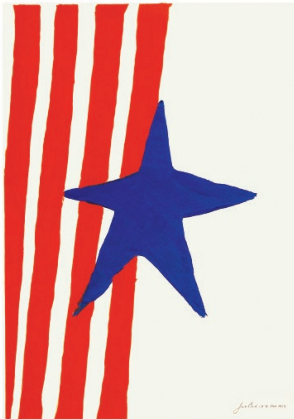
Jack Bush AMERICAN FLAG SERIES 1962, Gouache on Paper, 35 1/4 x 23 inches