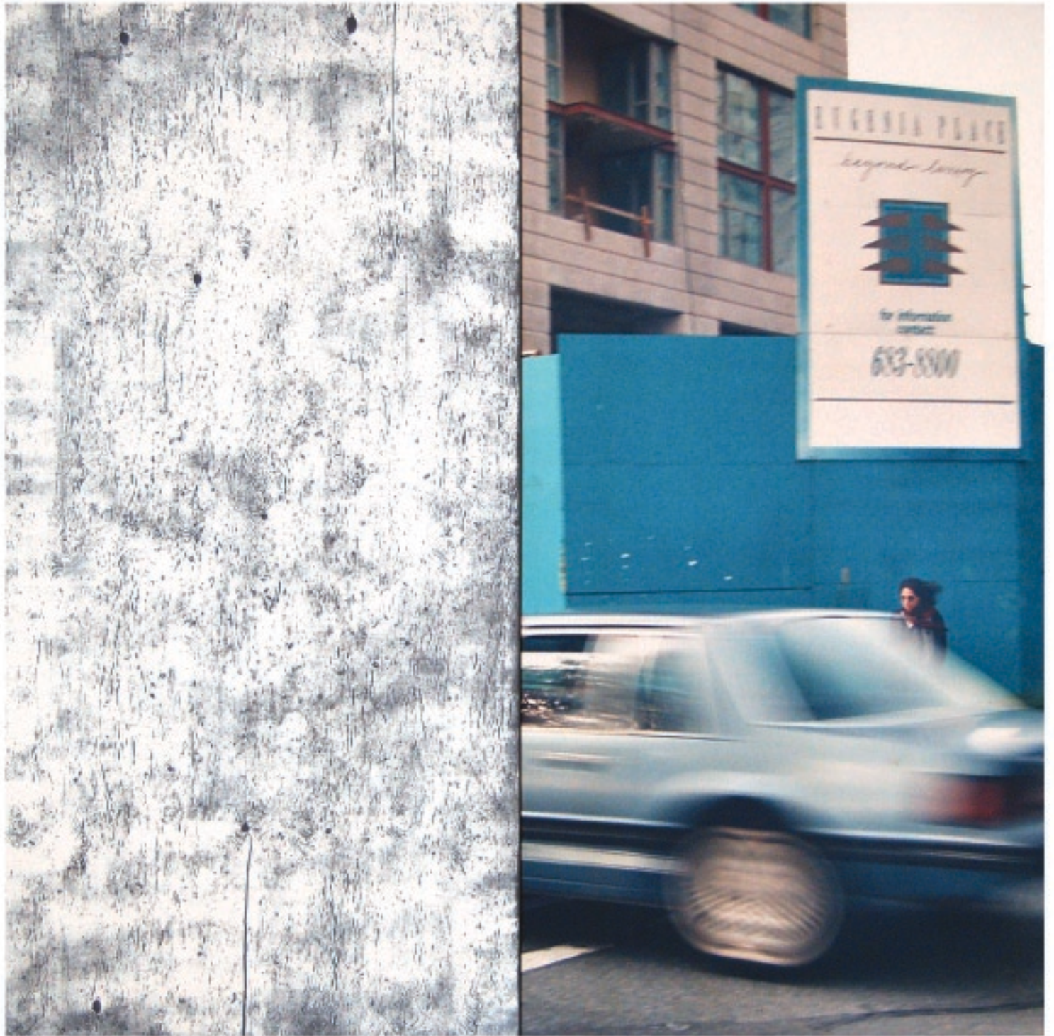
Ian Wallace IN THE STREET VANCOUVER (ESTHER II) 1990, Photograph and Acrylic on Canvas diptych - two panels each 97 1/4 x 48 1/2 inches