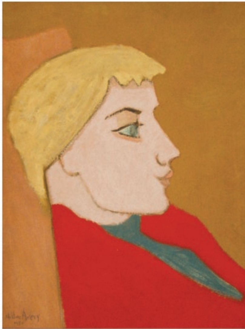
Milton Avery ARTIST'S DAUGHTER 1950, Oil on Canvas, 24 x 18 inches