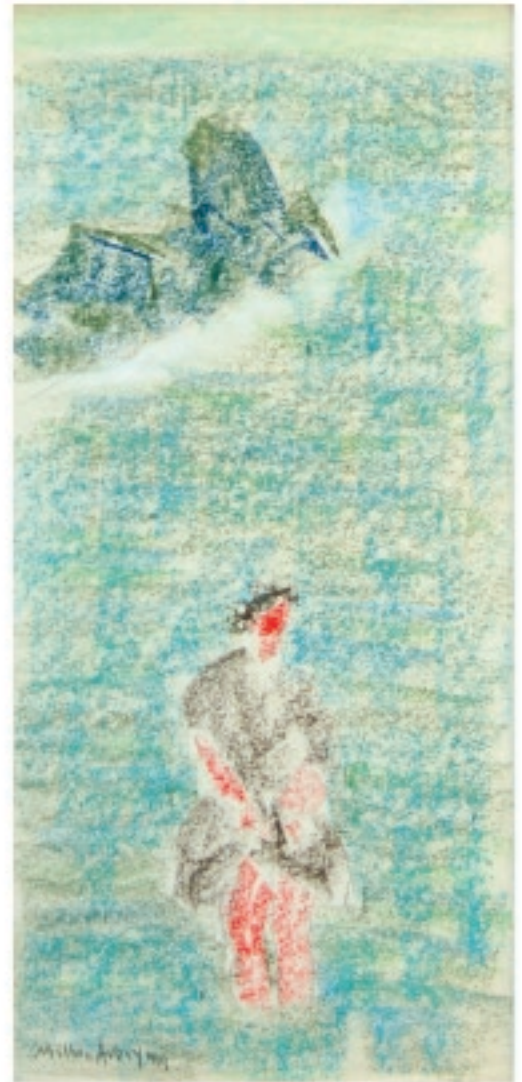
Milton Avery WADER 1959, Pastel on Paper 24 x 11 3/4 inches