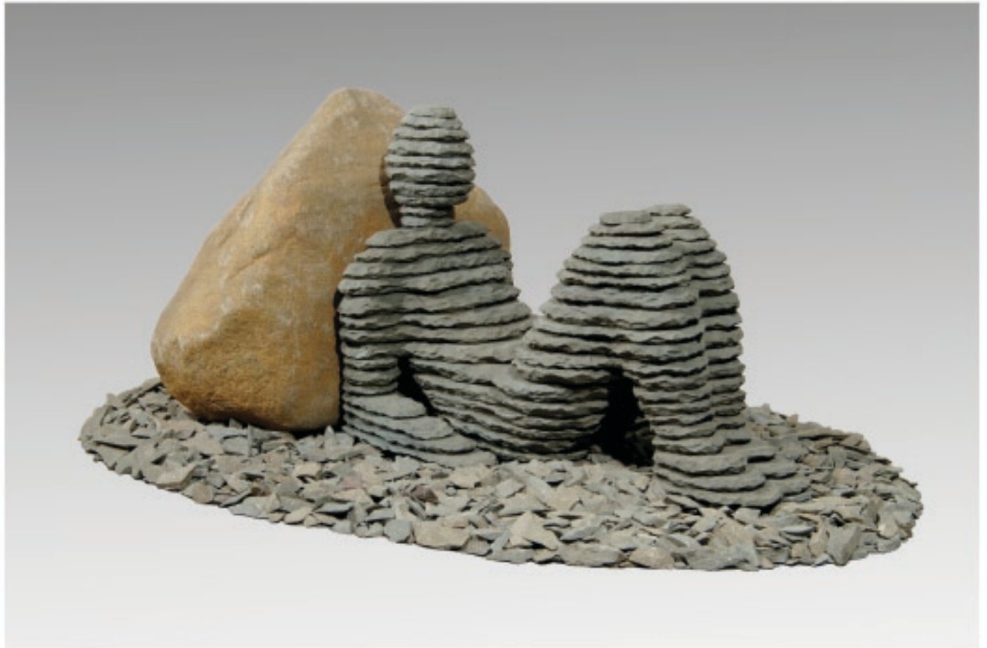
Boaz Vaadia AHIAM 2nd 2006, Bronze, Bluestone and Boulder Edition of 5, 32 x 90 x 60 inches