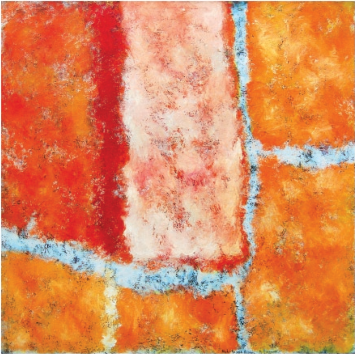
Jean McEwen PEINTURE 57 MIDI-TEMPS-ROSES 1957, Oil on Canvas, 38 x 38 inches

BACK COVER: Arman UNTITLED (VIOLONCELLE) 1999, Bronze, Wood, 45 x 26 1/2 x 17 inches