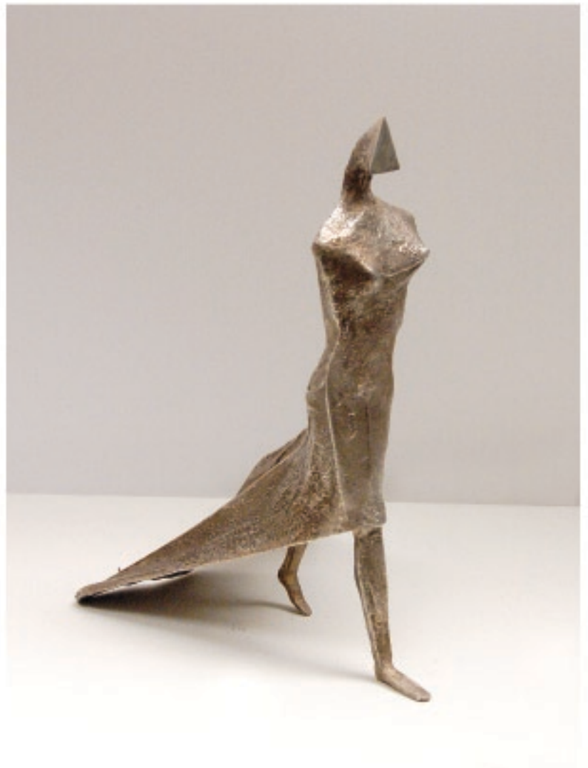
Lynn Chadwick MAQUETTE VII, WOMAN WALKING (C33A) 1986, Silver, Edition of 20 10 1/4 inches high