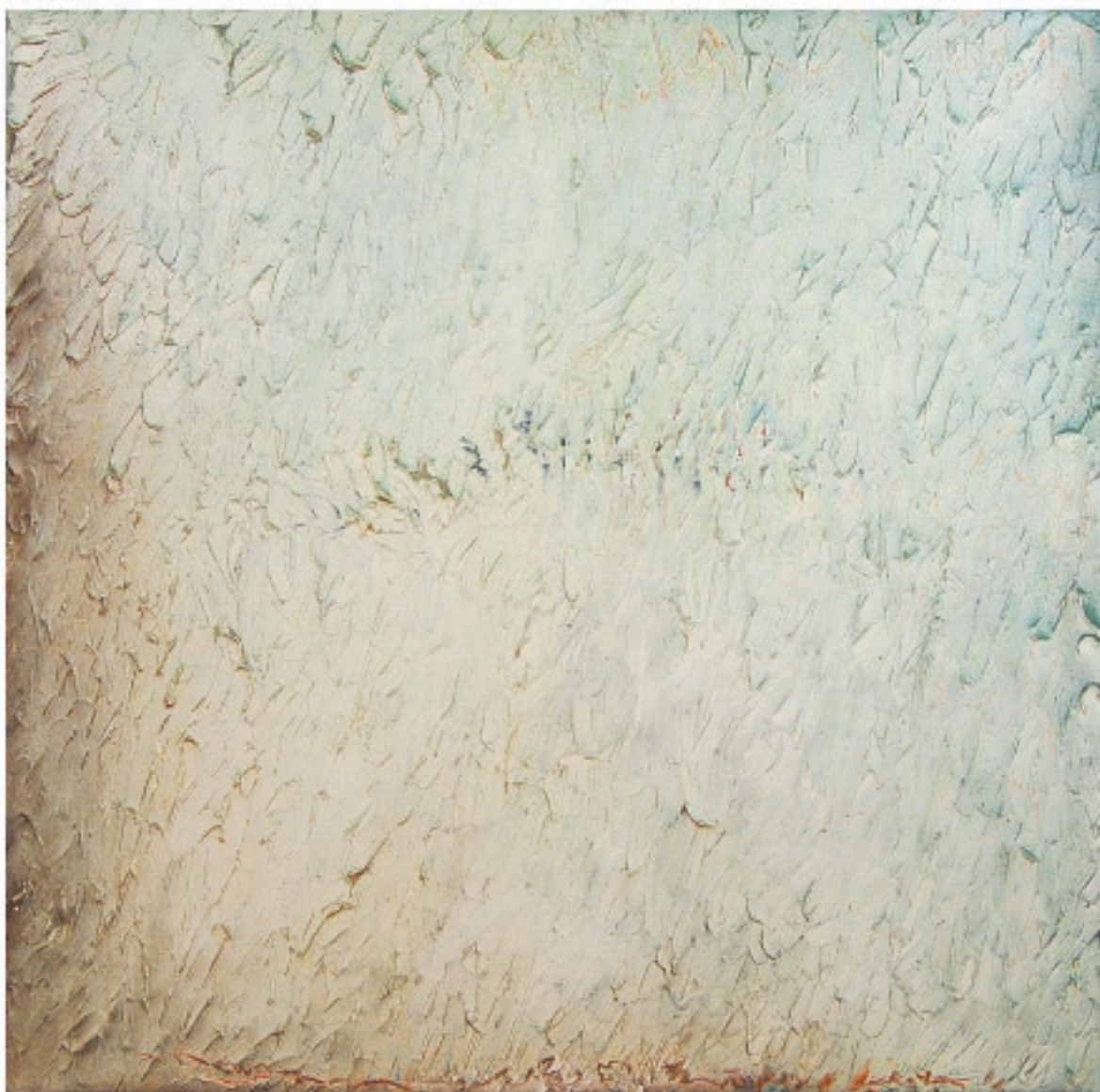
Stanley Boxer ASTUTE BLUSTERING SLING OF SILENCE 1979, Oil on Linen, 60 x 60 inches