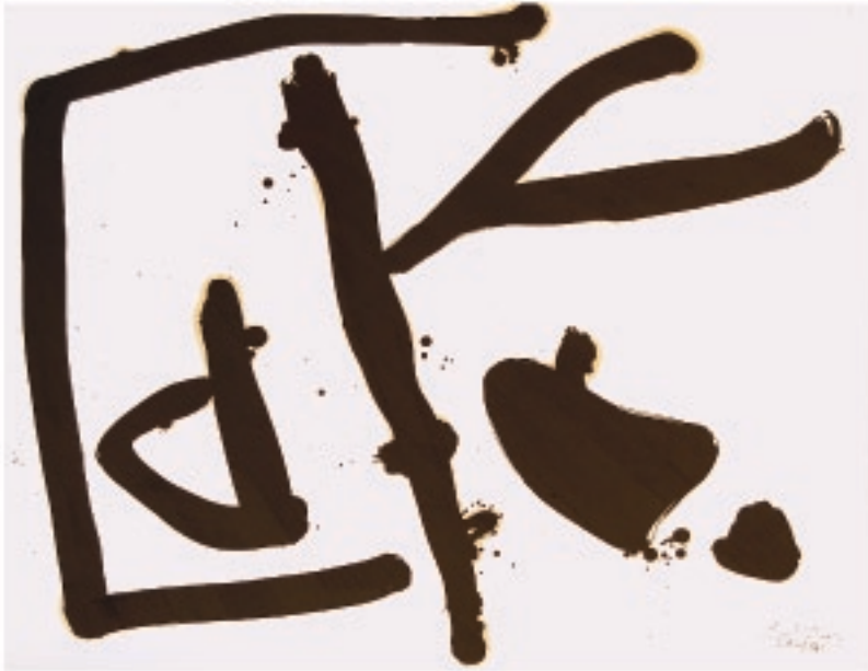
Robert Motherwell DRUNK WITH TURPENTINE #43 1979, Oil on Paper, 23 x 28 3/4 inches