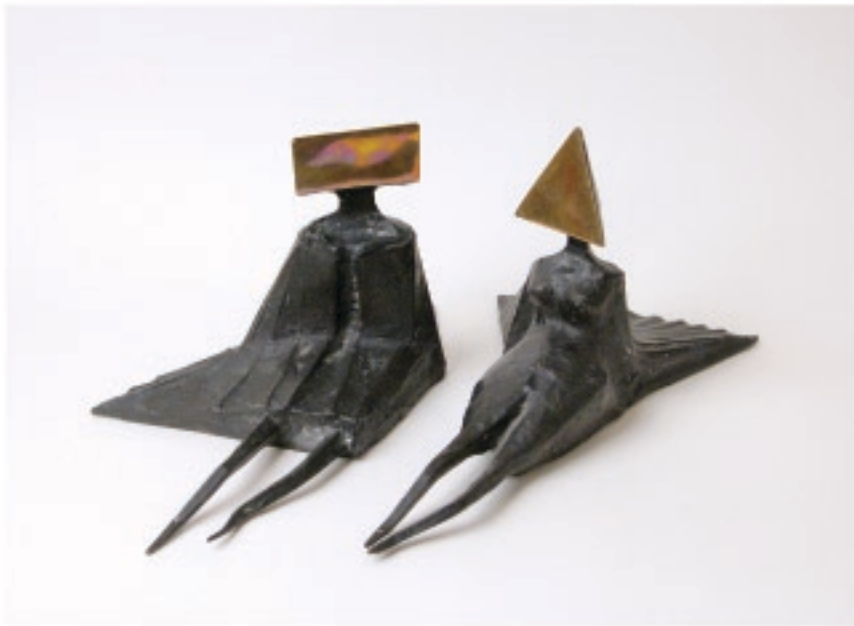
Lynn Chadwick SEATED COUPLE (C76) 1976, Bronze Edition of 8, 6 3/8 inches high