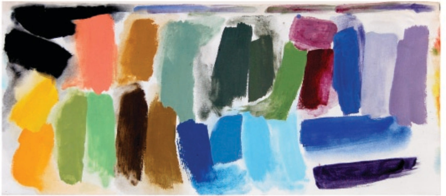
Friedel Dzubas COLOUR TEST 1987, Magna Acrylic on Canvas, 19 x 44 1/4 inches