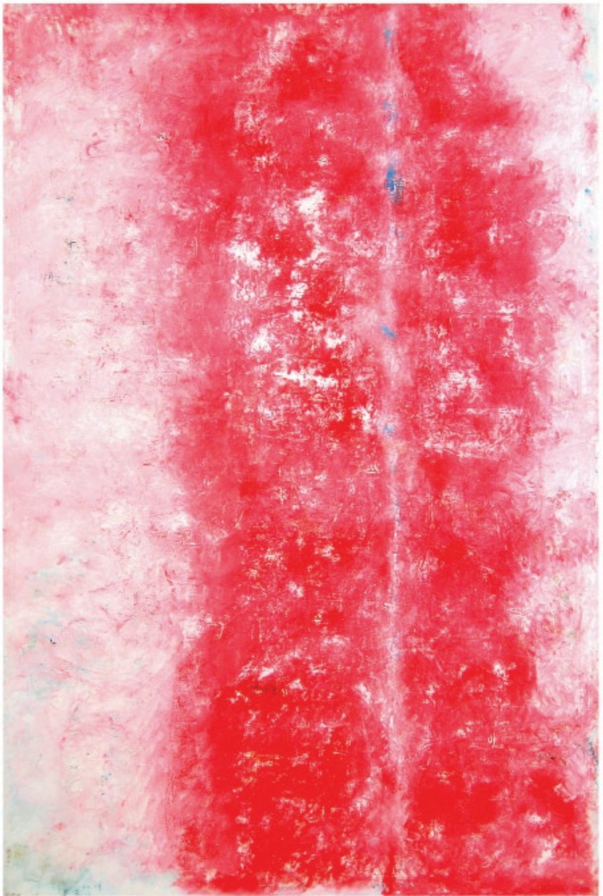
Jean McEwen VERTICAL TRAVERSANT LE ROUGE 1957, Oil on Canvas, 83 x 55 inches