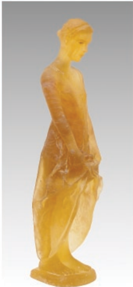
Nicholas Africano WOMAN WITH FRUIT 1996, Glass 23 x 6 x 7 inches