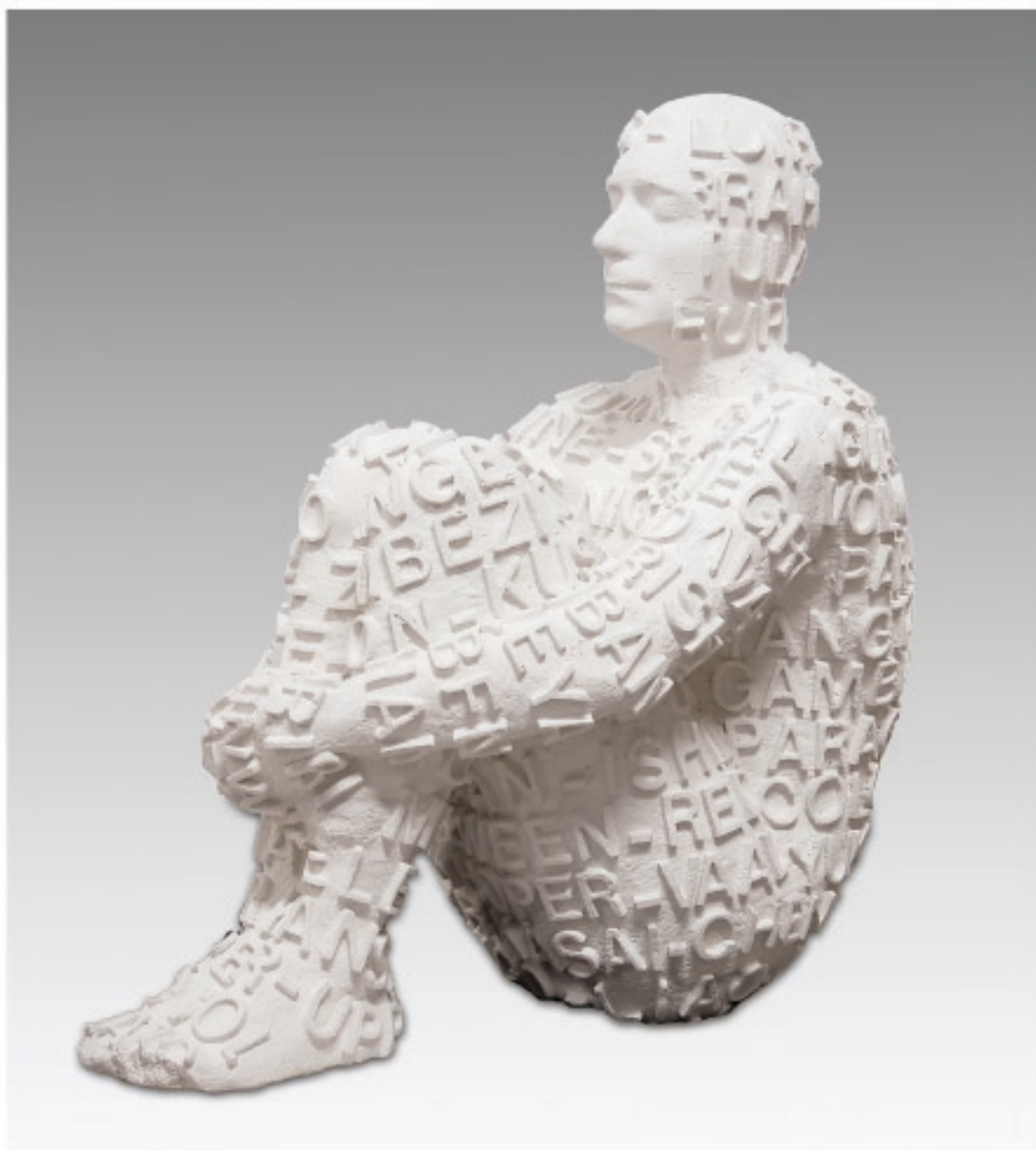
Jaume Plensa SELF PORTRAIT WITH RIVERS II 2006, Cast White Marble 37 x 21 1/4 x 30 3/4 inches