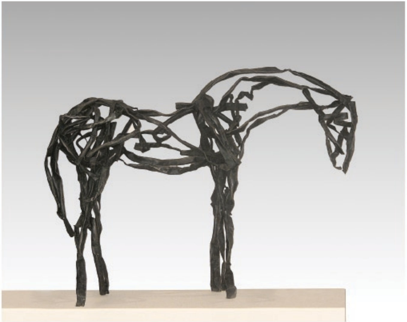
Deborah Butterfield UNTITLED 2007, Found copper, 34 x 45 x 14 inches