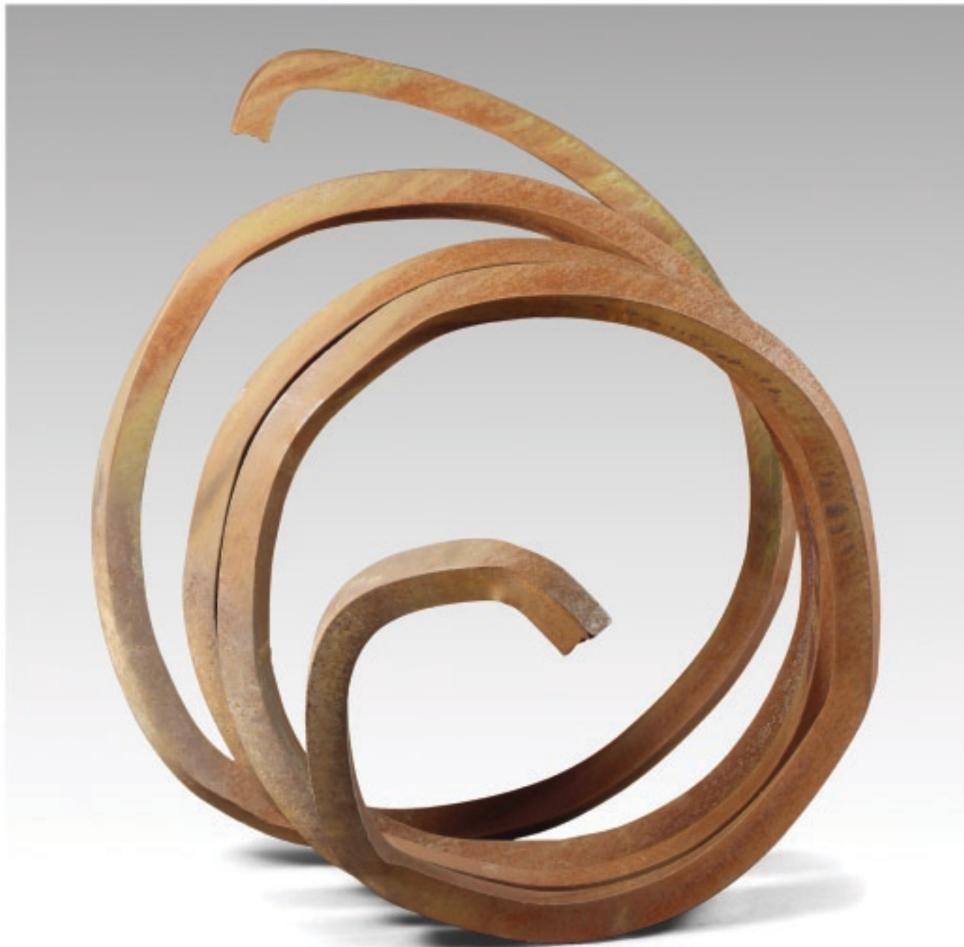
Bernar Venet INDETERMINATE LINE c.1987, Rolled Steel, 64 1/2 x 55 7/8 x 48 7/8 inches