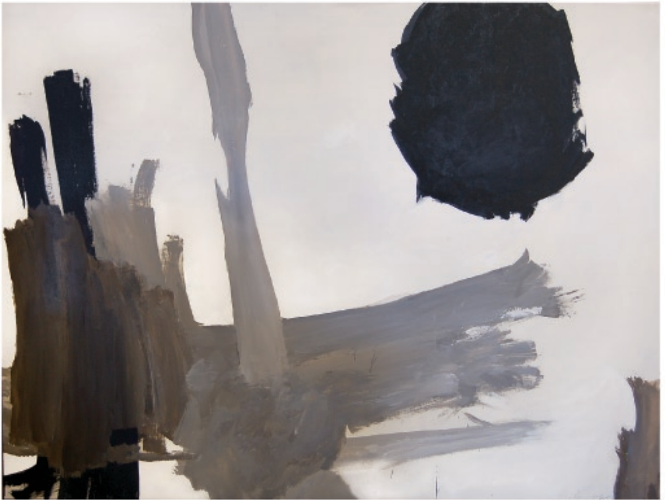
Jack Bush INTO ETERNITY 1958, Acrylic on Canvas, 75 x 95 1/2 inches