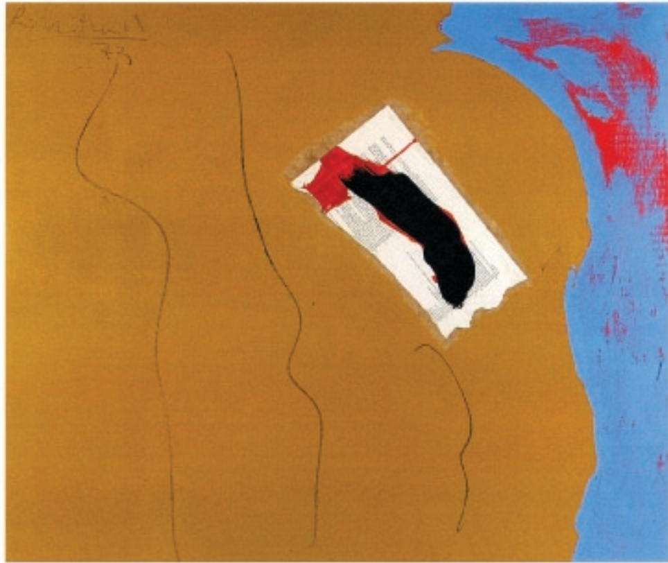
Robert Motherwell COLLAGE IN OCHRE WITH BLUE AND RED 1973, Acrylic, Collage and Crayon on Board 25 1/2 x 29 inches