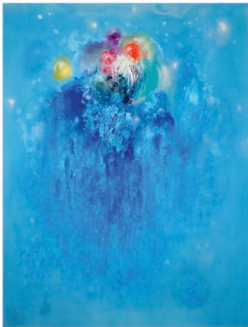
EMERGENCE #9 IN LIGHT BLUE 2008, Acrylic on Canvas 48 1/4 x 36 1/4 inches ( 122.5 x 92 cm ) signed & dated lower left signed, dated, titled verso