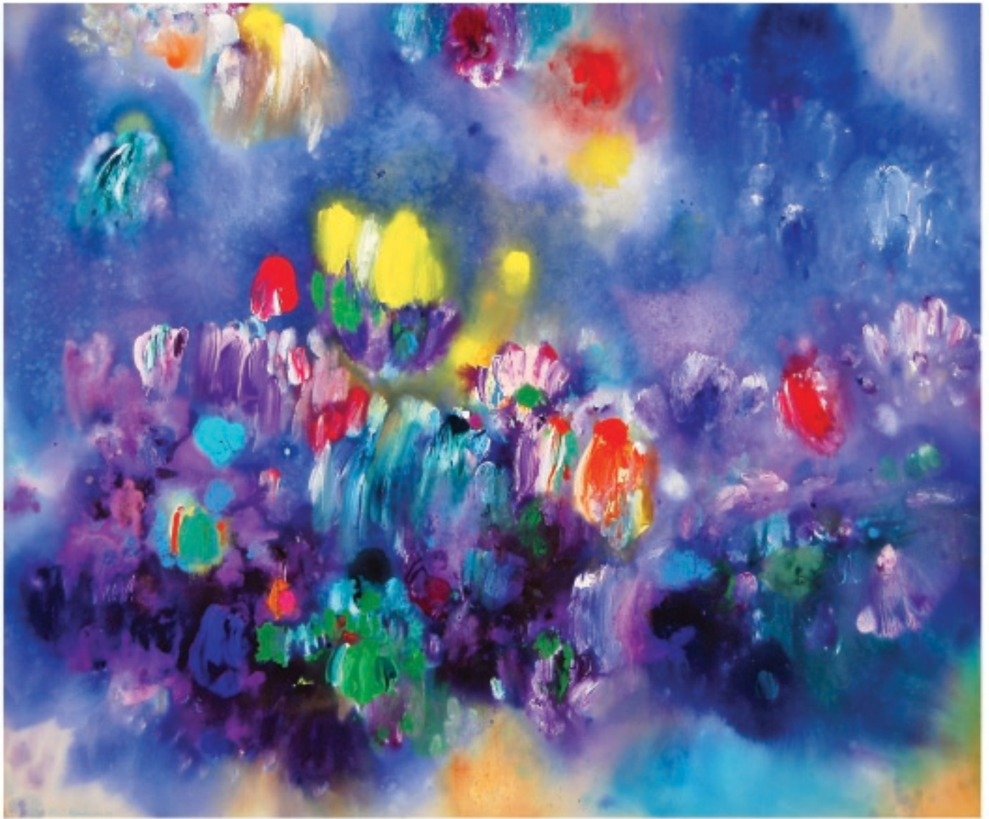
WONDERS IN THE BLUE 2008, Acrylic on Canvas 60 x 72 inches ( 152.5 x 183 cm ) signed & dated lower left signed, dated, titled verso