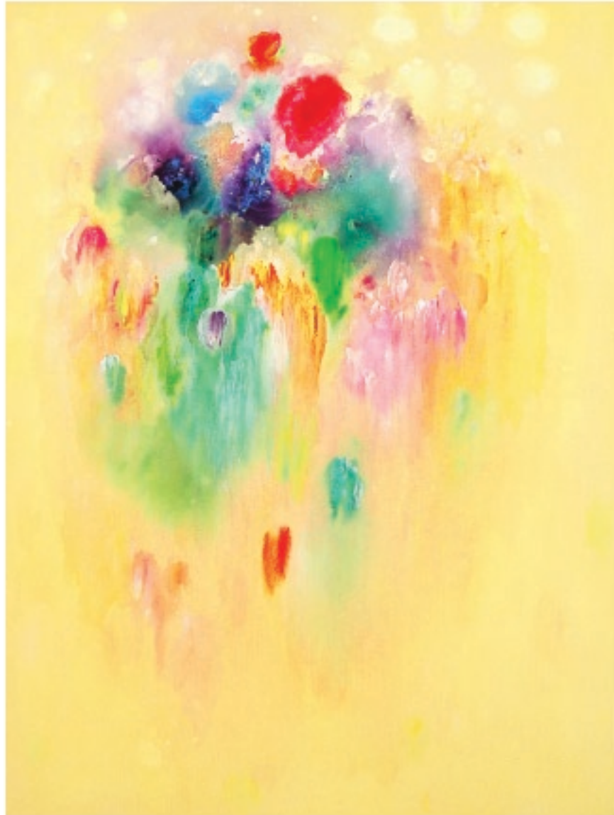
EMERGENCE #11 IN CITRON 2008, Acrylic on Canvas 48 3/16 x 36 3/16 inches ( 122.5 x 92 cm ) signed, dated, titled verso