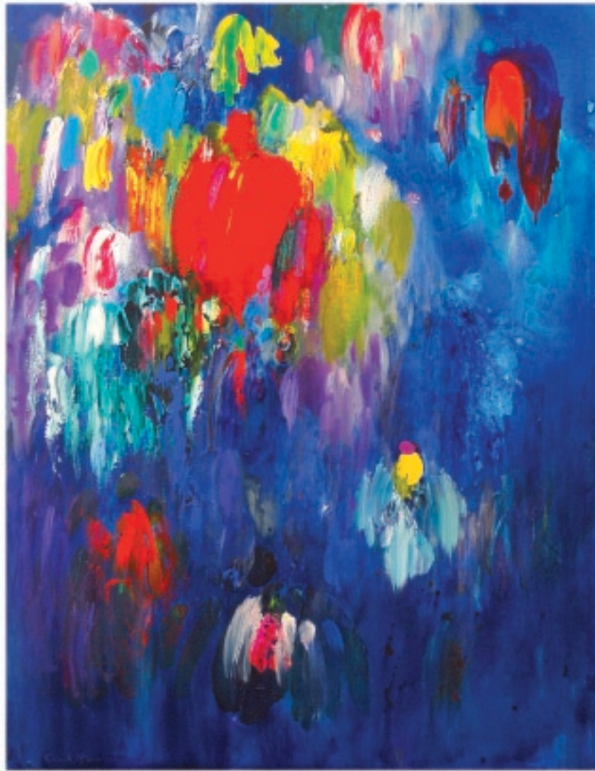
JUNGLE NIGHT SONG #1 2008, Acrylic on Canvas 40 x 30 inches ( 101.5 x 76 cm ) signed & dated lower left signed, dated, titled verso