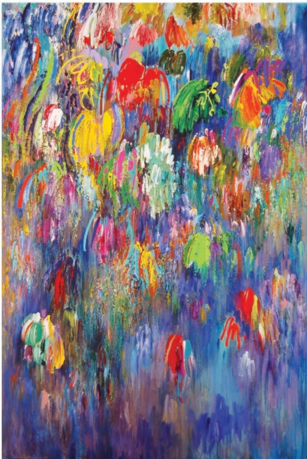
CONGO NOCTURNE 2007, Acrylic on Canvas 72 x 48 inches ( 183 x 122 cm ) signed & dated lower left signed, dated, titled verso