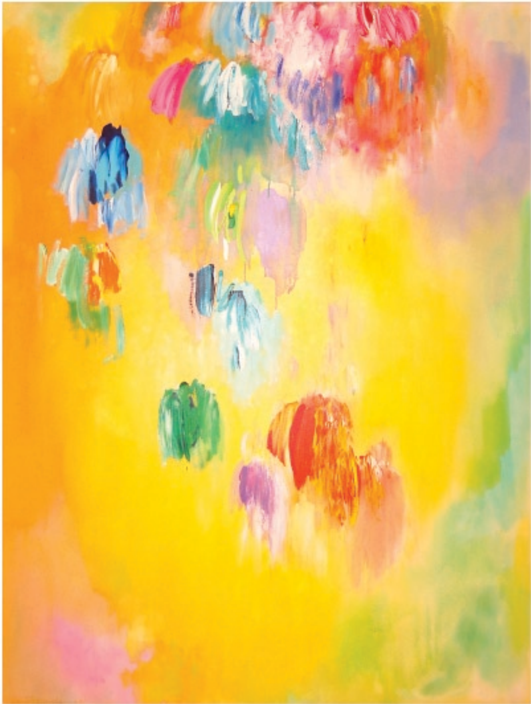
SUMMER PASSAGE 2007, Acrylic on Canvas 60 7/8 x 45 7/8 inches ( 154.5 x 116.5 cm ) signed & dated lower left signed, dated, titled verso