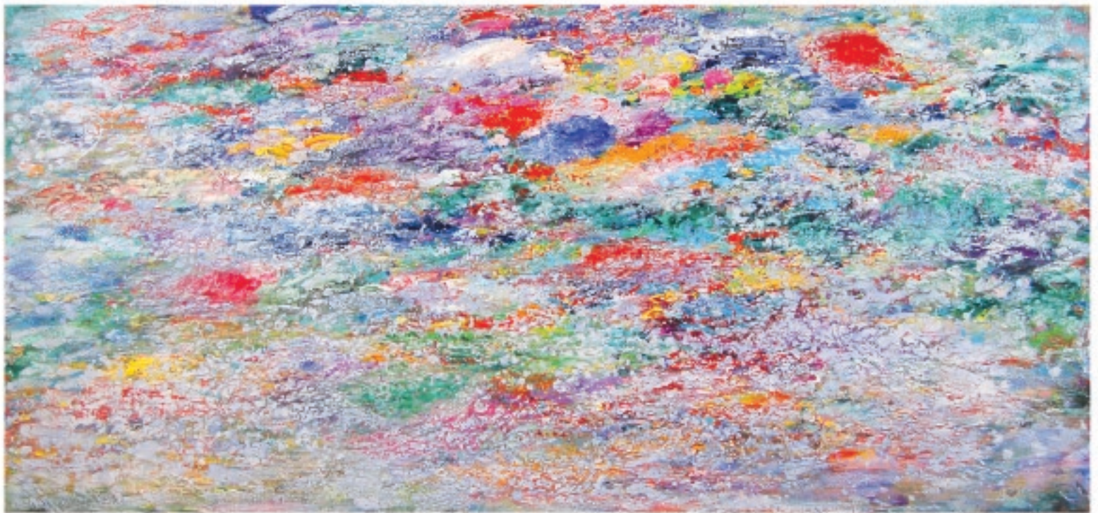
REEF SHALLOWS - SILVER 2008, Acrylic on Canvas 32 x 72 inches ( 81 x 183 cm ) signed & dated lower right signed, dated, titled verso