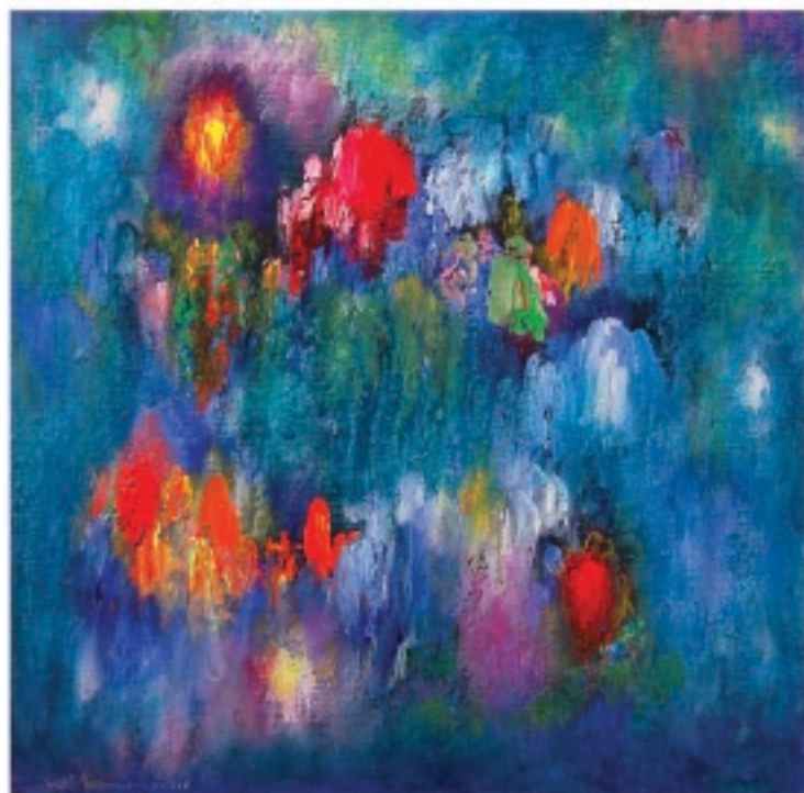
TROPIC NOCTURNE #2 2006-08, Acrylic on Canvas 24 x 24 inches ( 61 x 61 cm ) signed & dated lower left signed, dated, titled verso