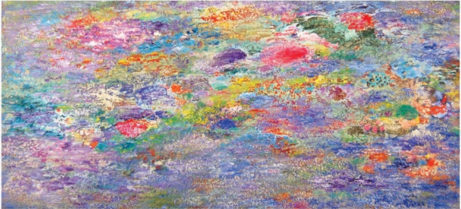
CORAL COAST SHALLOWS 2008, Acrylic on Canvas 32 x 72 7/8 inches ( 81 x 185 cm ) signed & dated verso