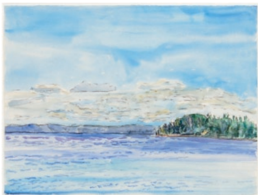
A SHELTERED BAY ON A WINDY DAY 2003, Watercolour on paper 22 x 29.75" / 56 x 75.5cm