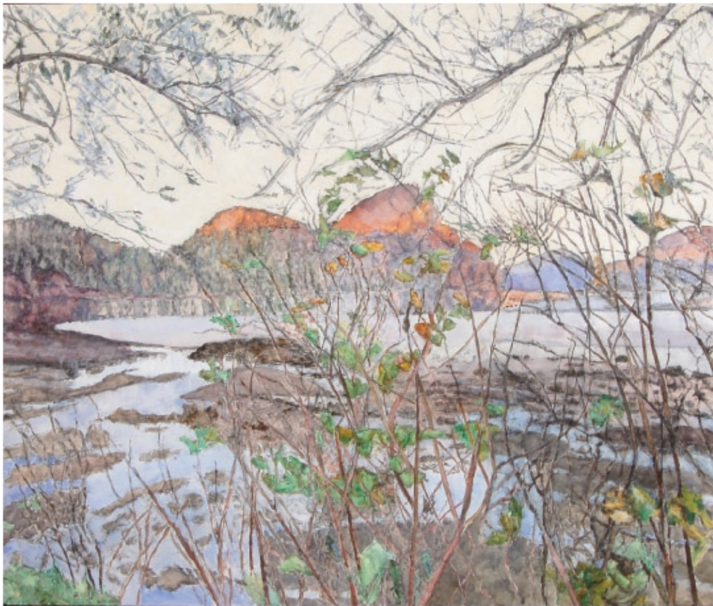
TOFINO SERIES #3 2008, Acrylic on canvas 60 x 72" / 152.5 x 183cm