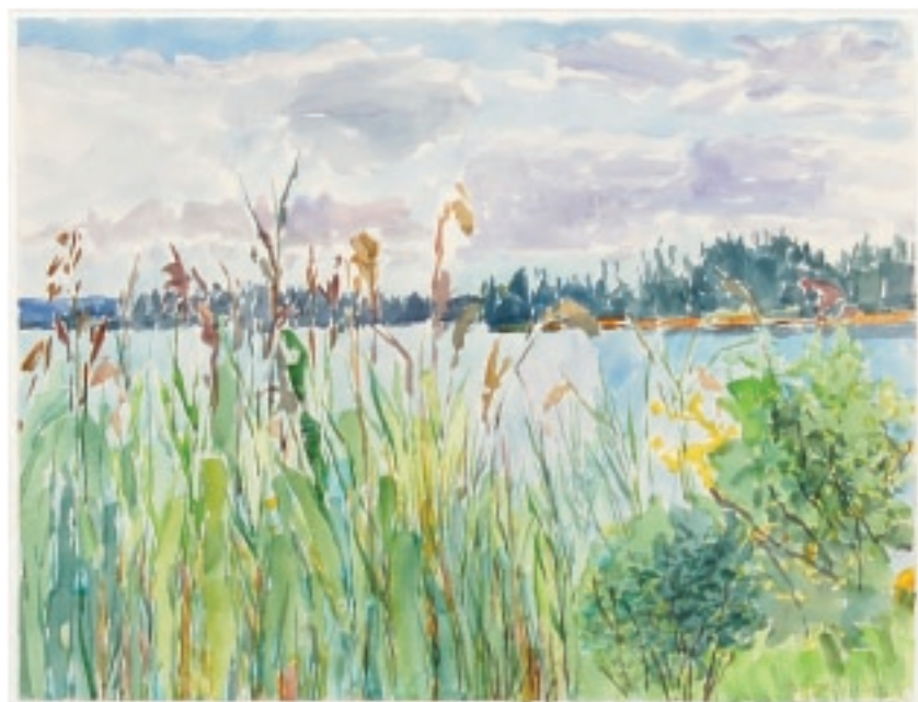
REEDS AT EMMA LAKE 2003, Watercolour on paper 22 x 29.75" / 56 x 75.5cm