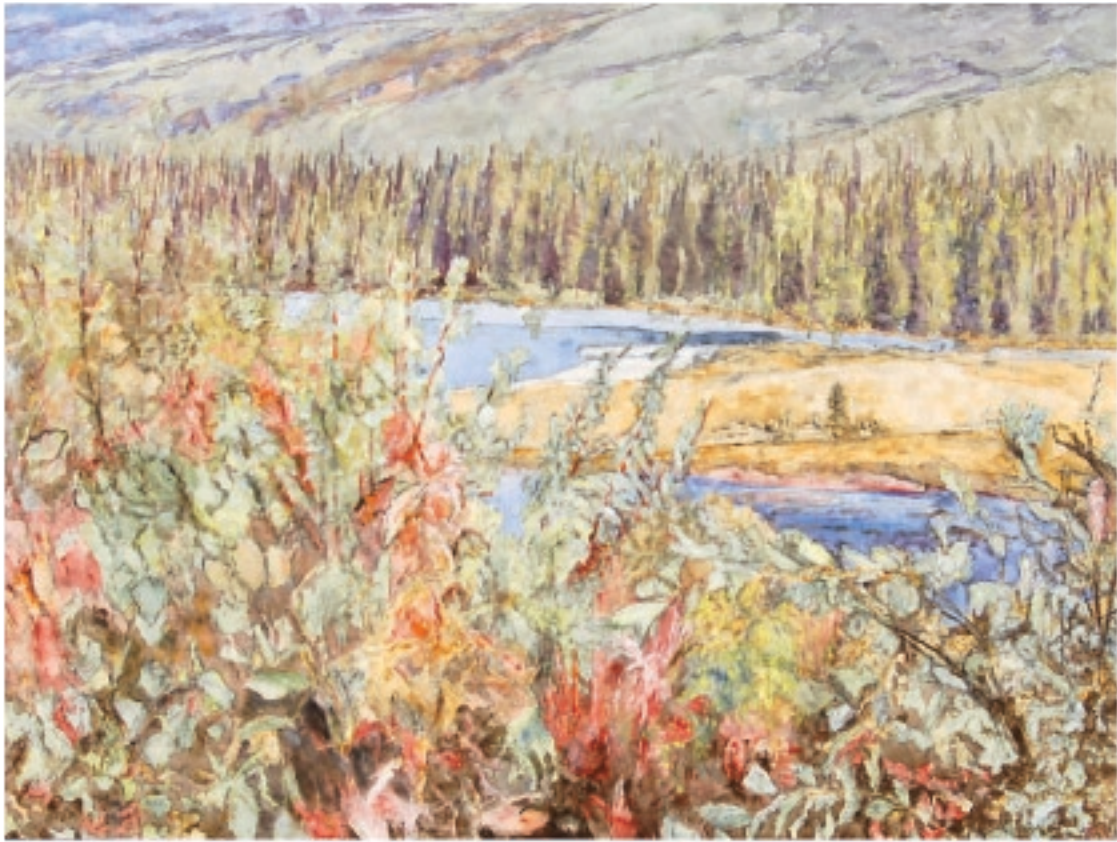
TANGLED FOREGROUND 2001, Acrylic on canvas 30 x 40" / 76 x 101.5cm