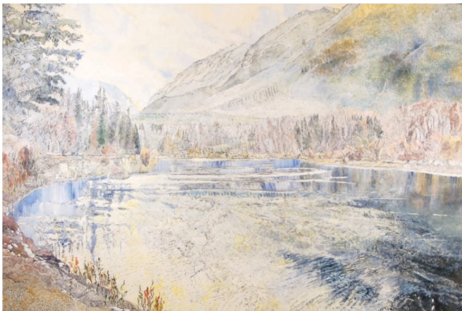
MOUNTAIN LAKE 1988, Acrylic on canvas 72 x 108" / 183 x 274.5cm