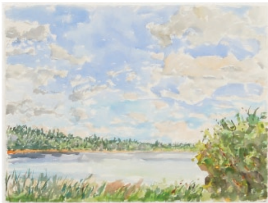
MURRAY POINT WITH A STRONG WEST WIND 2003, Watercolour on paper 22 x 29.75" / 56 x 75.5cm

Dorothy Knowles' life-long subject is the landscape of the Canadian west. She has traveled the prairies and into the Rockies and continued onwards to the Pacific Ocean. But above all it is the parklands of northern Saskatchewan, their rolling plains and the rivers and valleys cutting into them that she has studied with loving attentiveness. This is her Algonquin Park and her north of Lake Superior. It is a farmed and man-shaped land, and yet too vast to walk, its horizons lying only at the distance encompassed by the imagination.