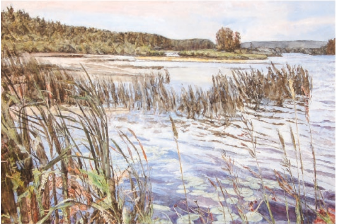
LILIES AND REEDS 2008, Acrylic on canvas 48 x 72" / 122 x 183cm