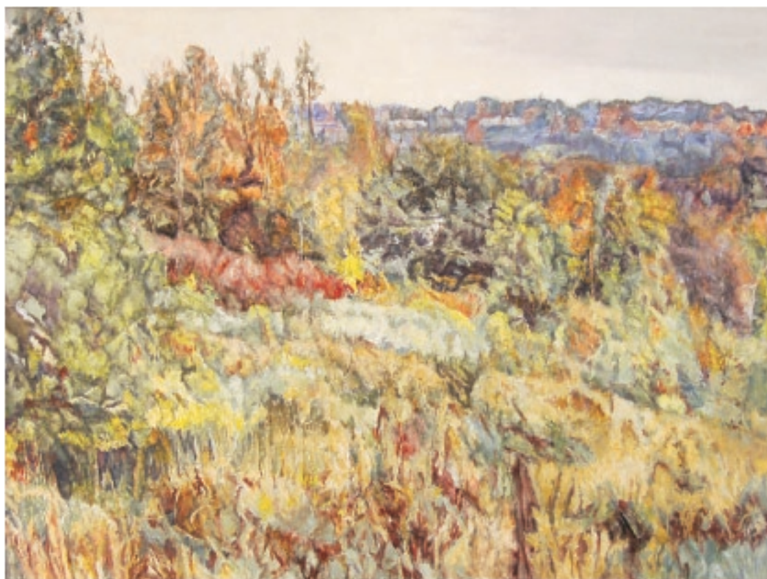
EARLY FALL 2007, Acrylic on canvas 40 x 60" / 101.5 x 152.5cm