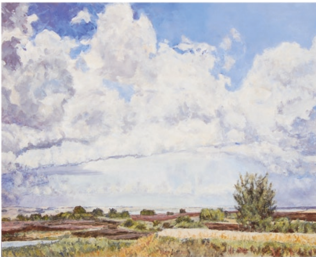
CLOUDS AND PRARIE 2008, Acrylic on canvas 48 x 60" / 122 x 152.5cm