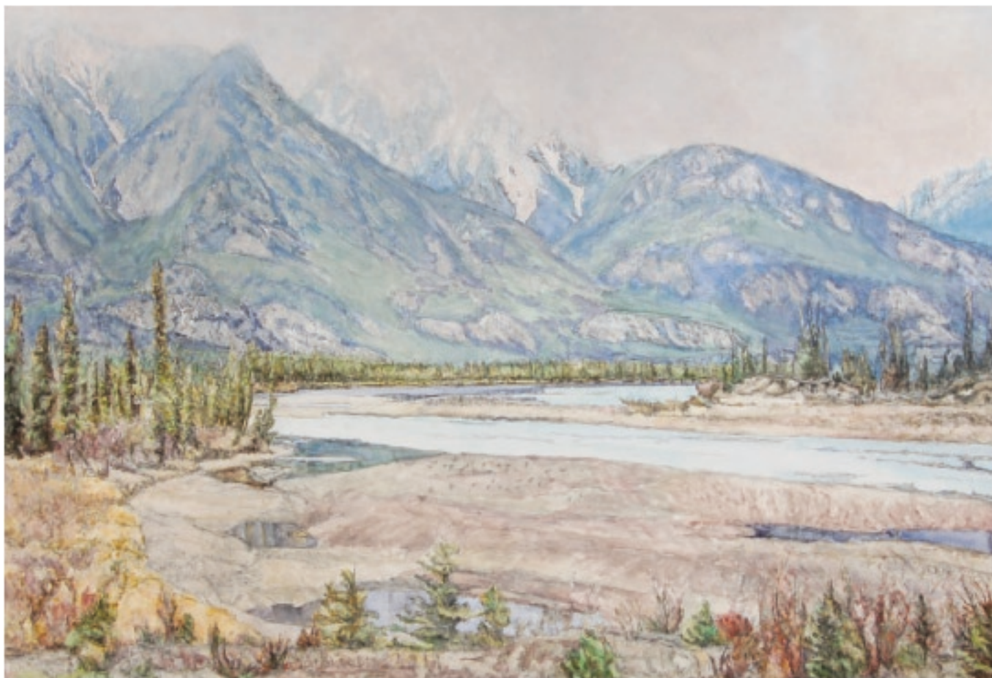
MOUNTAINS AND WATER 2008, Acrylic on canvas 48 x 72" / 122 x 183cm