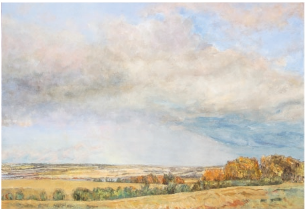
CLOUDS OVER THE PRARIE 2003, Acrylic on canvas 40 x 60" / 101.5 x 152.5cm