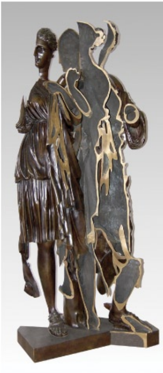
Arman DIANA, NOLI ME TANGERE 1986, Bronze, Edition 1/2 68 x 31 x 20" ( 173 x 79 x 53cm ) signed