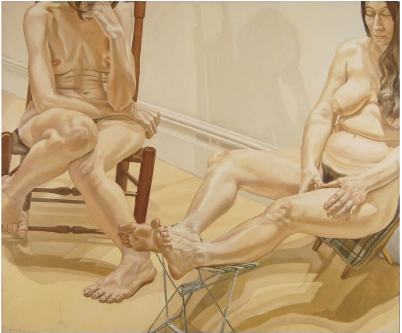
Philip Pearlstein TWO NUDES WITH CAMP CHAIR 1969, Oil on Canvas 60.5 x 72.5" ( 153.5 x 184cm ) signed, dated lower left