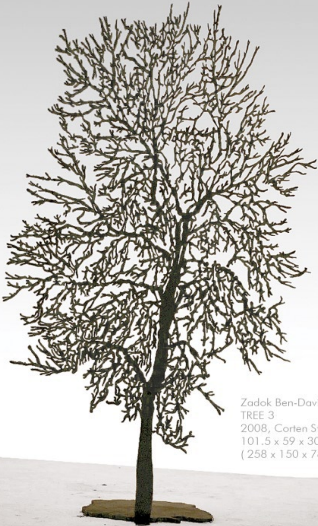
Zadok Ben-David TREE 3 2008, Corten Steel 101.5 x 59 x 30.75" ( 258 x 150 x 78cm )