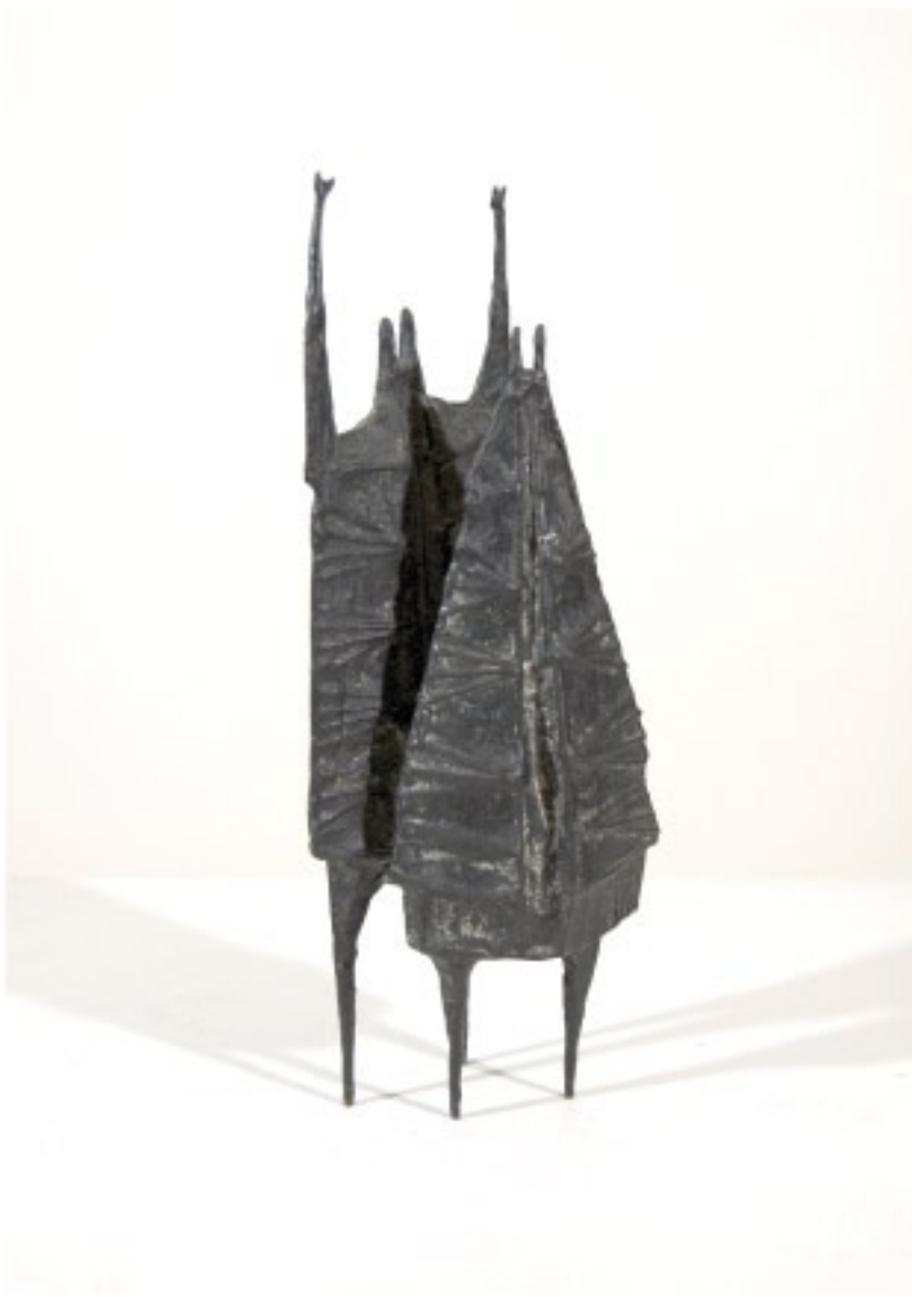
Lynn Chadwick MAQUETTE II FOR TEDDY BOY & GIRL 1956, Bronze, Edition of 6 15 x 6.5 x 5" ( 38 x 16.5 x 12.5cm ) signed