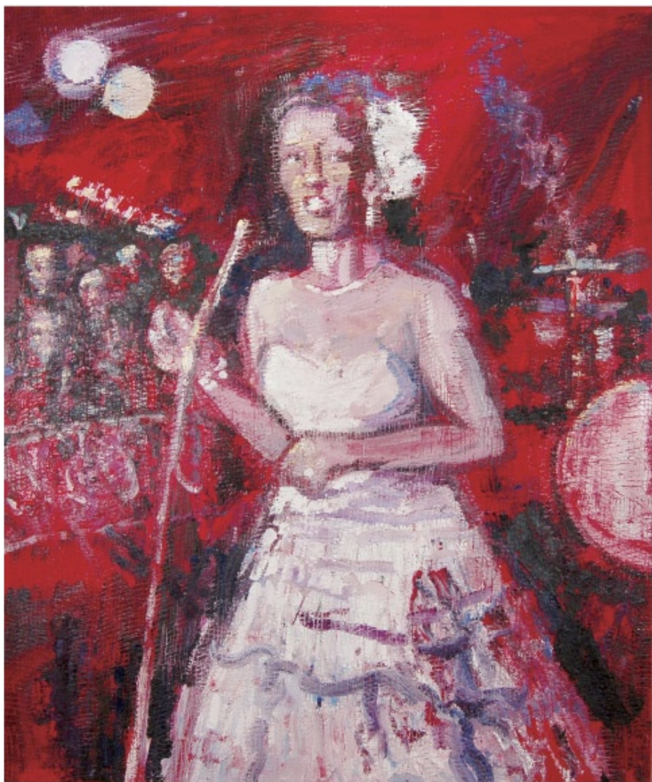
Hunt Slonem BILLIE 2008, Oil on Wood 72 x 60" ( 183 x 152.5cm ) signed, titled, dated verso