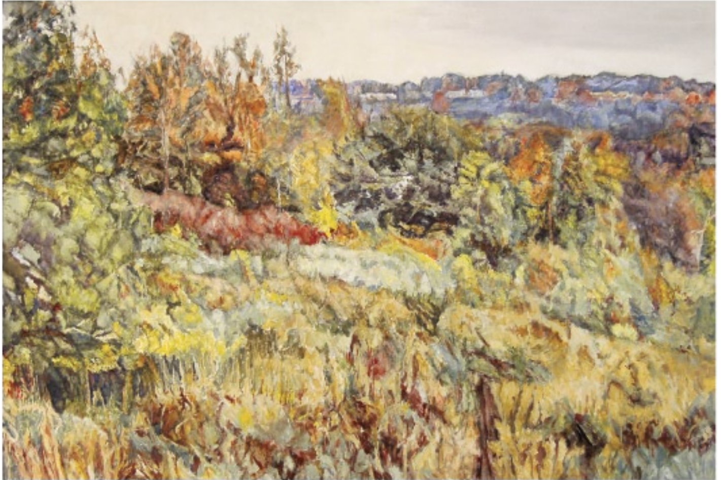
Dorothy Knowles EARLY FALL 2007, Acrylic on Canvas 40 x 60" ( 101.5 x 152.5cm ) signed verso