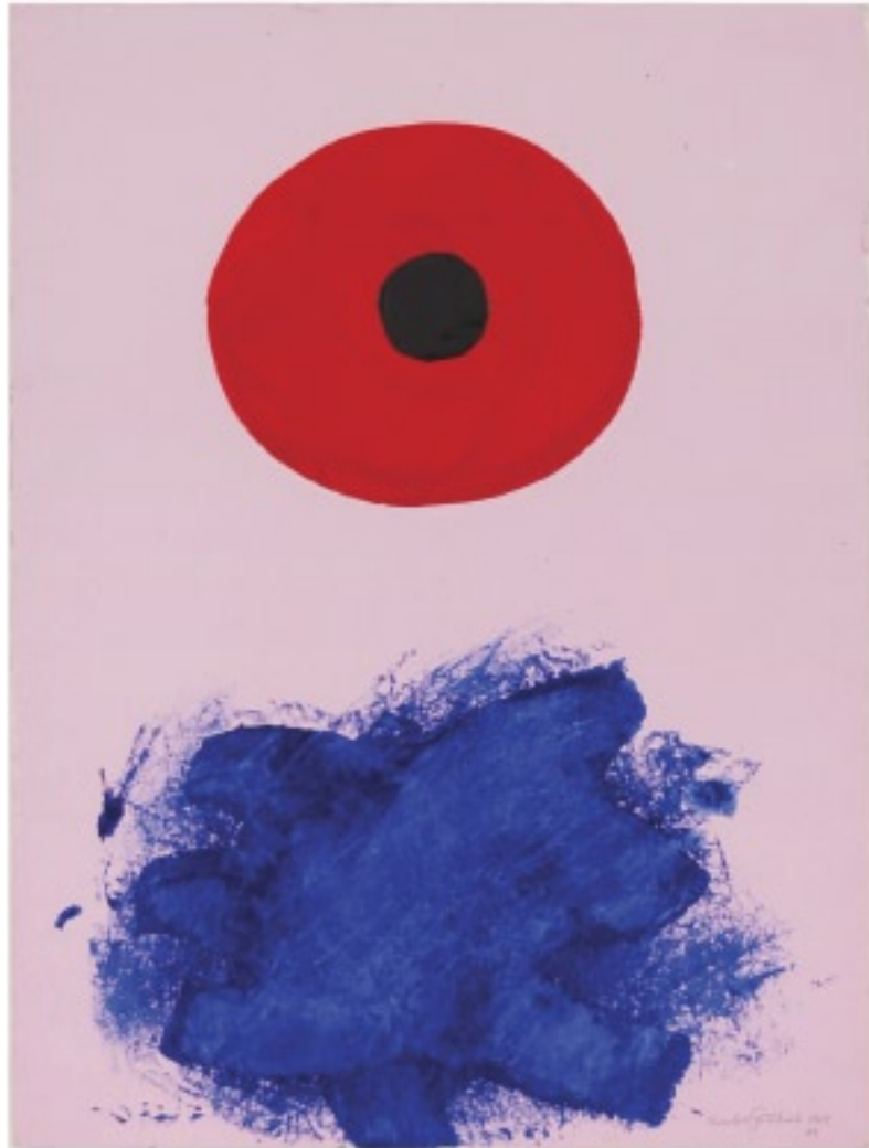
Adolph Gottlieb RED HALO - PINK GROUND 1967, Acrylic on Paper 20 x 15" ( 51 x 38cm ) signed, dated lower left