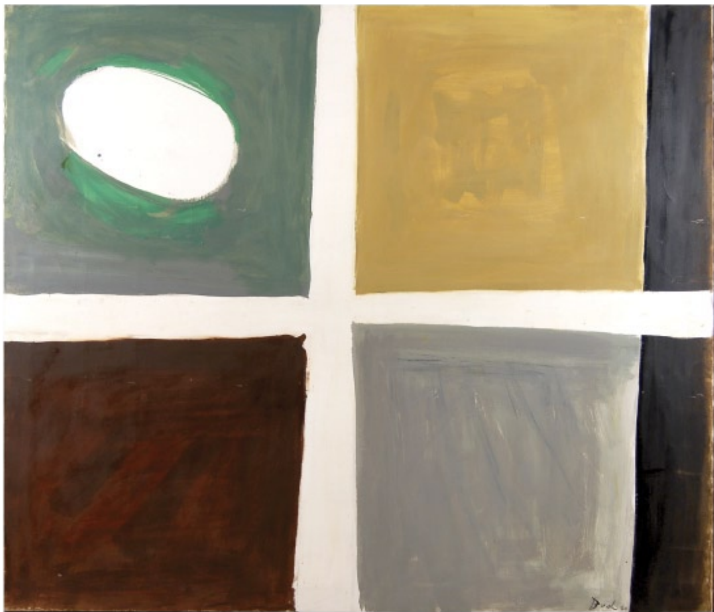
Jack Bush GREYS - SQUARES 1961, Oil on Canvas 61 x 81.5" ( 155 x 207cm ) signed, dated lower right signed, dated, titled verso