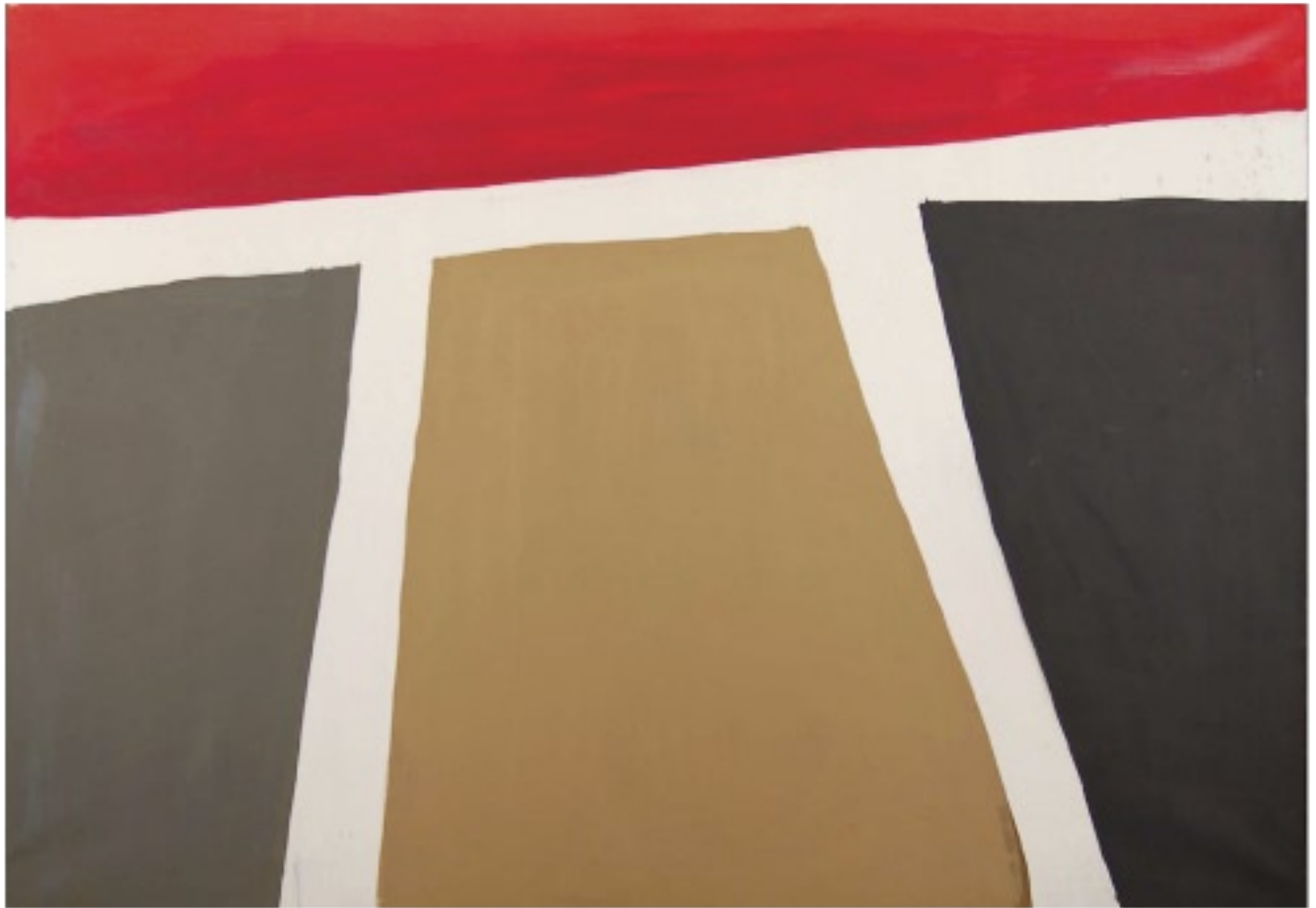
Jack Bush DECEMBER 1961, Oil on Canvas 46 x 66" (117 x 167.5cm) signed, dated verso