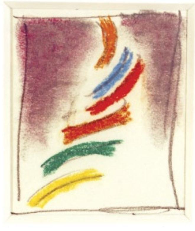
Jack Bush UNTITLED c. 1970, Oil crayon on paper 2.5 x 1.75" ( 6.5 x 4.5cm )