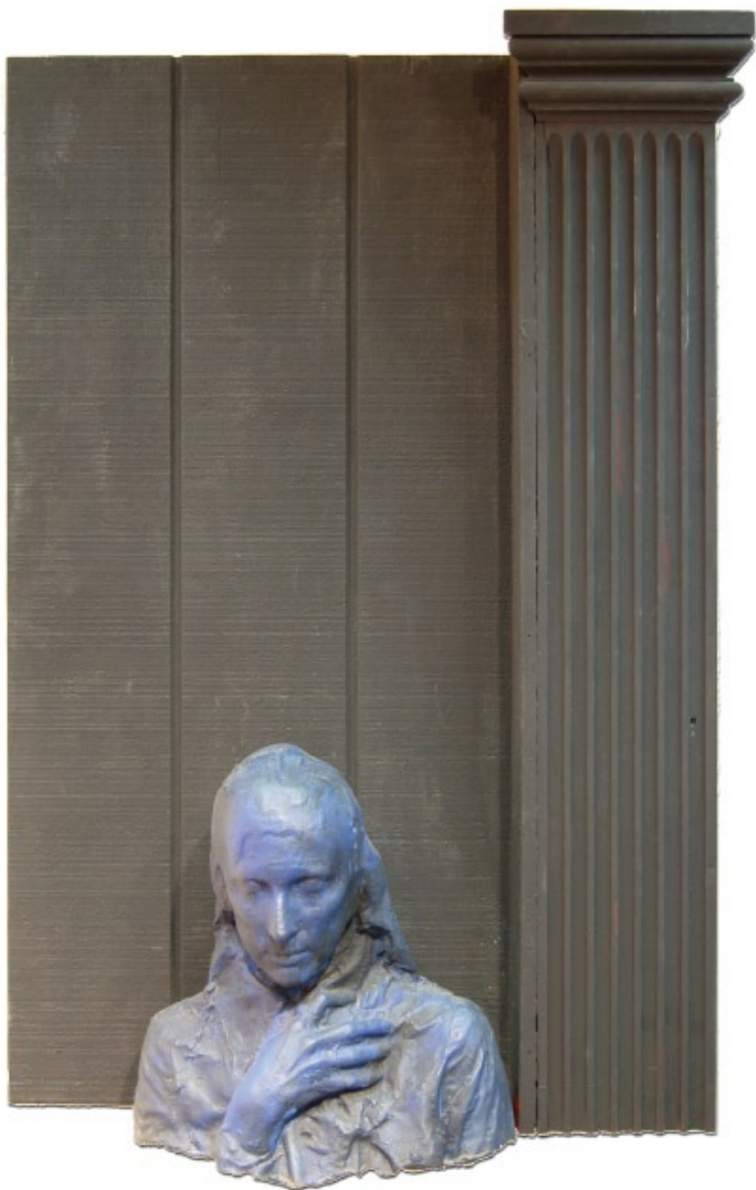
George Segal WOMAN NEXT TO BLACK COLUMN 1981-88, Plaster and Wood 48.25 x 33.5 x 8.75" ( 122.5 x 85 x 22cm )