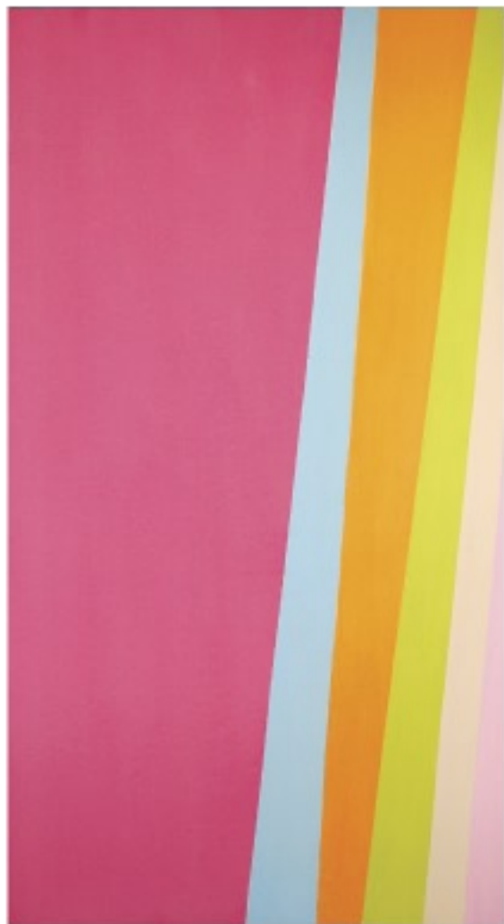
Jack Bush BIRTHDAY 1969, Acrylic on Canvas 49.5 x 26.25" (125.5 x 66.5cm ) Signed and dated verso