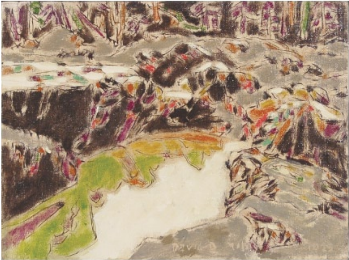
David Milne FLOODED PROSPECT SHAFT 1929, Oil on Canvas 12.25 x 16" ( 31 x 40.5cm ) signed, dated lower right