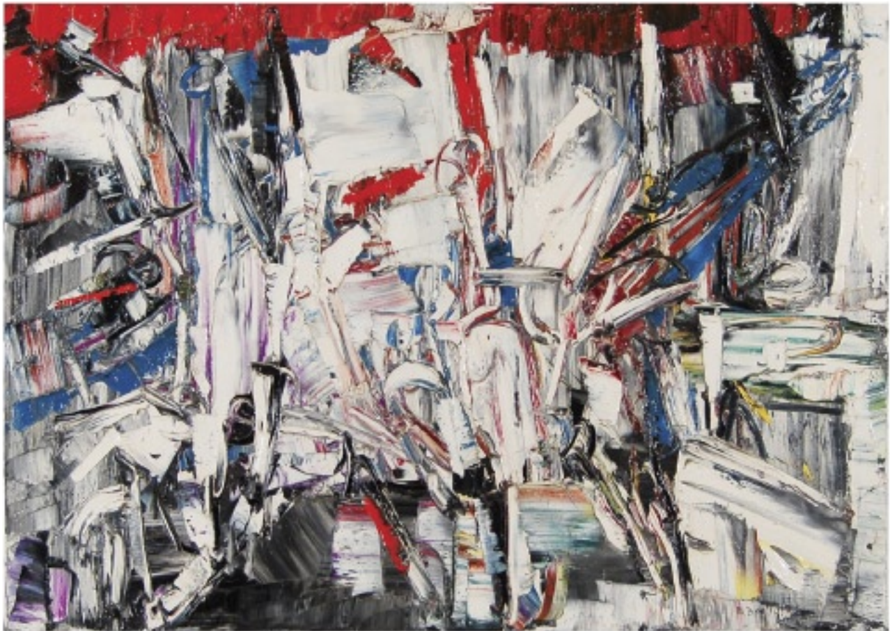
Jean-Paul Riopelle EIPHANIE 1956, Oil on Canvas 29 x 39.25" ( 73.5 x 99.5cm ) signed, dated lower right