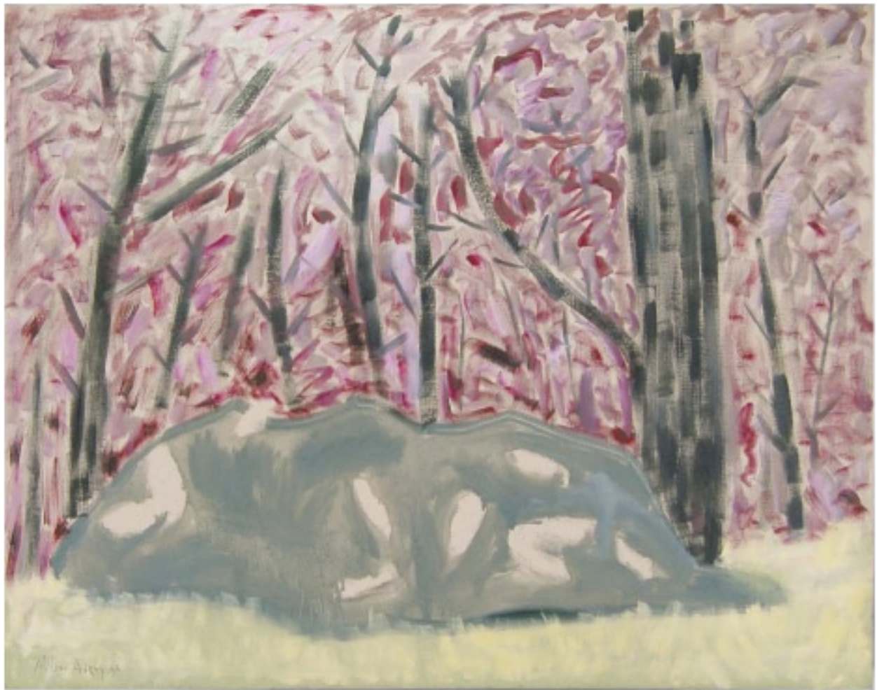
Milton Avery PIGEONS ON THE ROCKS 1961, Oil on Canvas 32 x 40" ( 76 x 101.5cm ) signed, dated lower left