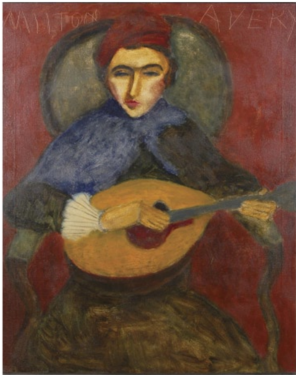
Milton Avery MANDOLIN PLAYER 1931, Oil on Canvas board 36 x 28" (91.5 x 71 cm) signed top left and right