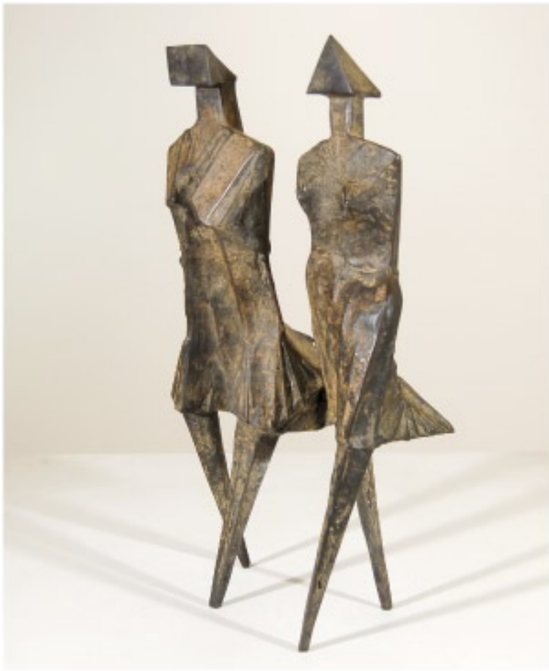
Lynn Chadwick WALKING COUPLE 1980, Bronze, Edition 2/9 18 x 10.25 x 7.75" ( 45.5 26 x 20cm ) intialled