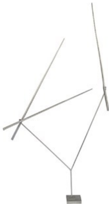
George Rickey UNTITLED 1990, Stainless Steel, Edition 2/3 52 x 30 x 4" ( 132 x 76 x 10cm ) signed, dated