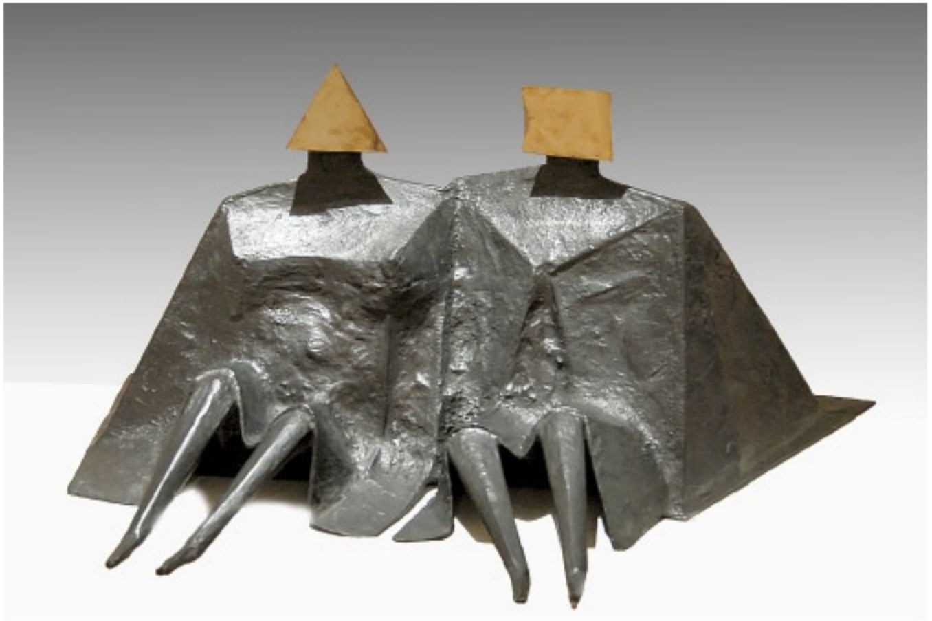
Lynn Chadwick SITTING COUPLE II 1989, Bronze, Edition 2/9 18 x 10.25 x 7.75" ( 45.5 26 x 20cm ) initialled