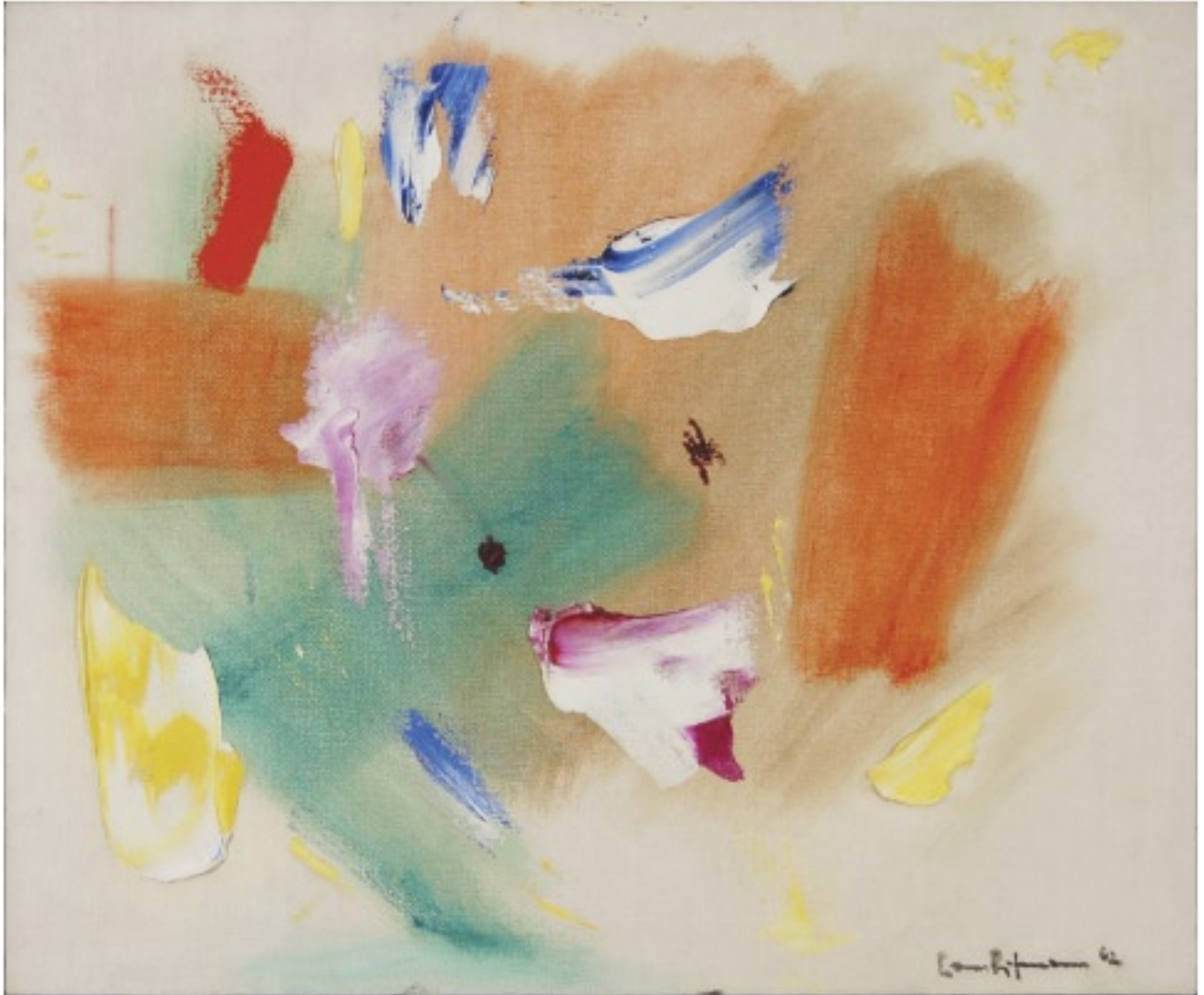
Hans Hofmann FOREBODING OF SPRING 1962, Oil on Canvas 25 x 30" ( 63.5 x 76cm ) signed, dated lower right