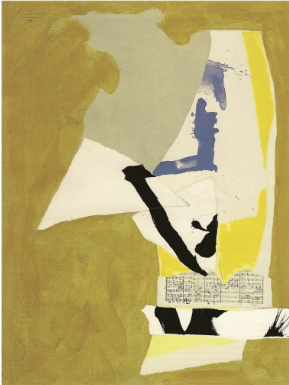
Robert Motherwell NIP AND TUCK 1984, Acrylic Collage and Ink on Canvas board 40 x 30" ( 101.5 x 76cm ) signed, dated upper left