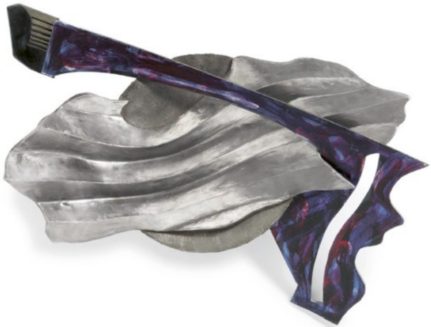
Frank Stella STUBB'S LAST MEAL 1986, Bronze and Steel, Edition 3/3 28 x 42 x 17" ( 71 x 106.5 x 43cm ) signed

"The paintings got sculptural because the forms got more complicated. I've learned to weave in and out."