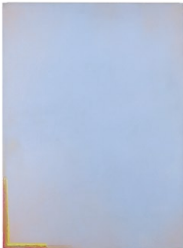
Jules Olitski UNTITLED 1968, Acrylic on Carton 40 x 29.75" ( 102 x 76cm )